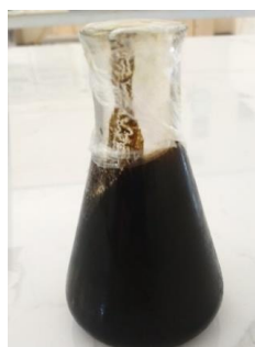
Figure 2. Betel Leaf Extract

The following is a picture of the betel leaf extract produced after evaporation.