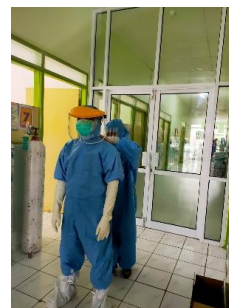
Figure 6. Test Swab Microba Hazmat Suit pretest

A nurse who has used a hazmat shirt sprayed with spray the betel leaf extract then took measures to treat COVID-19 patients in the isolation room at the Goetheng Purbalingga Hospital for approximately two hours. After that, the test swab Microbes were returned as a post-test to determine the number of microbes after treatment. Figure 6 shows the test swab microbes after the nurse acts.