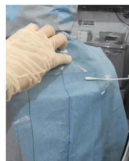
Figure 4. Test Swab Microbe Hazmat Suit Pretest

Before being treated using spraying, spray betel leaf extract first tested swab microbes to determine the number of microbes before treatment. Figure 4. shows the test process swab microbe on a hazmat suit.