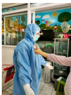
Figure 5. The Process of Spraying Hazmat Shirts with Spray Betel Leaf Extract

Figure 4 is a test process for swab microbes on hazmat clothes before applying spray betel leaf extract. This preliminary or pretest is to determine the number of microbes before treatment. After that, the hazmat suit was sprayed with spray betel leaf extract that had been made. The following is spraying the extract on hazmat clothes using spray betel leaf extract.