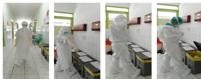
Figure 7. The Process of Removing The Hazmat Shirt

After the post-test swab test, the hazmat clothes that have been used are disposed of at a waste collection site. The following is a picture of the time of removing the hazmat shirt after treatment.