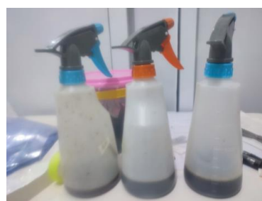
Figure 3. Spray Betel Leaf Extract with Concentration Variation of 2.5%; 5% 7.5%

later be applied to hazmat clothes used by health workers who will take action on COVID-19 patients in the isolation room of the Gotheng Purbalingga hospital.