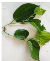
Figure 1. Betel Leaf

Betel leaf has a macroscopic form in a single leaf, short stem, heart-shaped leaf blade slightly oval or wide, 10-15 cm long, 5-7 cm wide, smooth leaf edges. The upper surface is shiny green, and the lower surface has a faded green colour with 5-7 leaf bones (Novita, 2016).